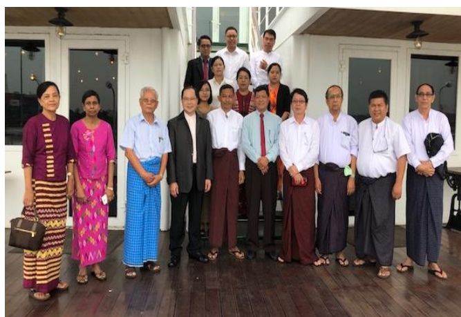
Meeting with the local organization committee, Nov 20, 2017, Yangon, Myanmar

prevention, psychiatric treatment, psychotherapy, and others. Travel awards for distinguished poster presentations will be awarded to several young psychiatrists. Participants are encouraged in the discussions of these and many topics for future solutions of the development of mental health in the region.