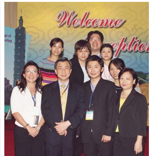
Organising Committee 12th PRCP Scientific Meeting