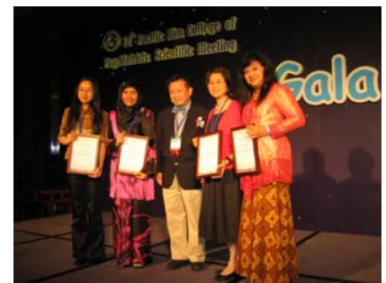
PRCP Travel Award recipients